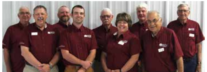
2022 MJM Board of Directors and CEO

ARE YOU INTERESTED IN AN IMPORTANT AND VITAL LEADERSHIP ROLE AT MJM?