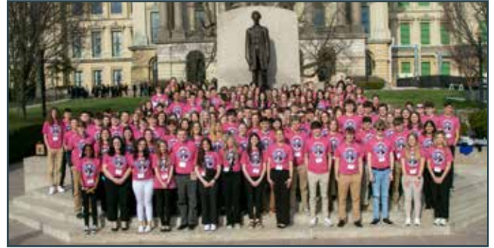
Photos (top to bottom): Operation Round Up in Staunton, storm assistance at Spoon River Electric Cooperative, Cooperative Lobby Day, Jersey County CEO Program, AIEC 2023 Youth Day.